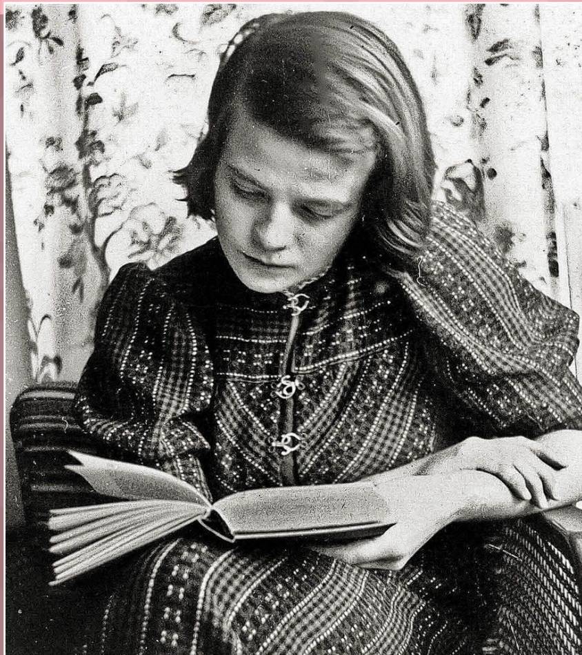
Sophie Scholl, one of the young leaders of the White Rose