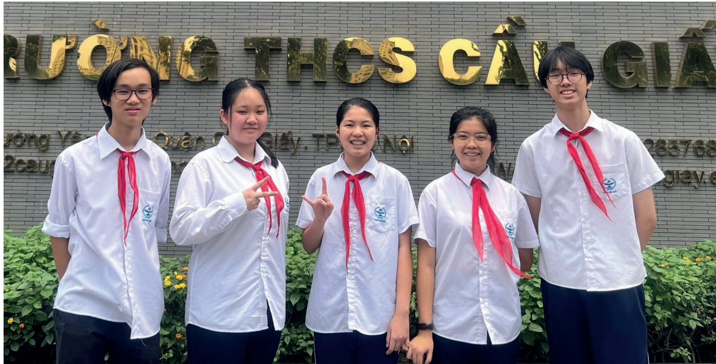
Your World 22/23 winning team, Cau Giay Secondary School, Vietnam

We are excited to invite students to participate in the global British Council Partner Schools video competition - Your World. The competition is open to all students who take UK International School Qualifications - IGCSE, O-Levels and A-Levels aged between 14 and 17. Students need to create a video to demonstrate a social action project showcasing progress on the theme of Climate change: From crisis to action. The theme is linked to United Nations Sustainable Development Goal number 13.