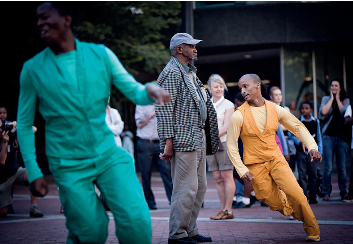
ConTatto, DaMotus, 2014