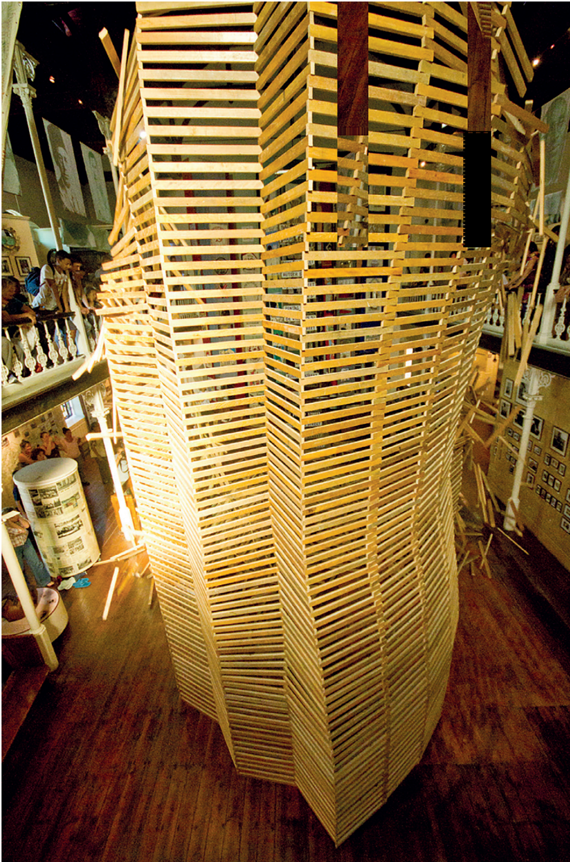
Under Construction , Aenas Wilder, Infecting the City , 2013, Produced by Africa Centre, © Sydelle Willow Smith