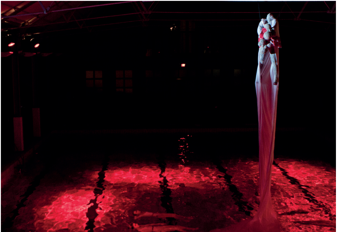
Ilulwane, Athi-Patra Ruga, Infecting the City 2012, Produced by Africa Centre, © Sydelle Willow Smith