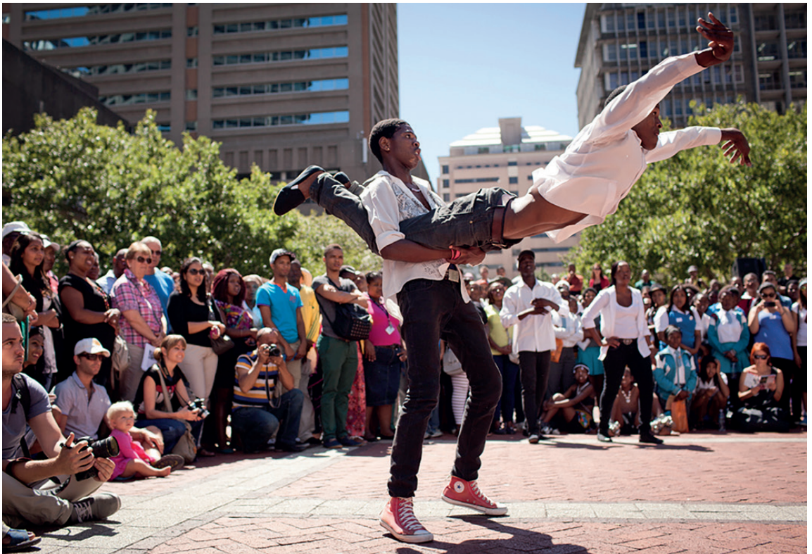
Dancenation, 2014