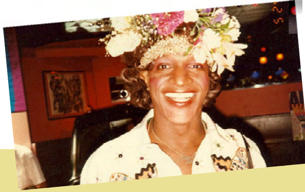
Marsha P Johnson