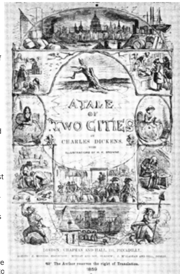
Hablot Knight Browne

They could be part of normal lessons, or take place outside school hours. Some schools may only wish to enter the competition, whilst others may share pieces of work with partner schools, or embark on a longer joint project involving collaboration over a number of subject areas and the development of