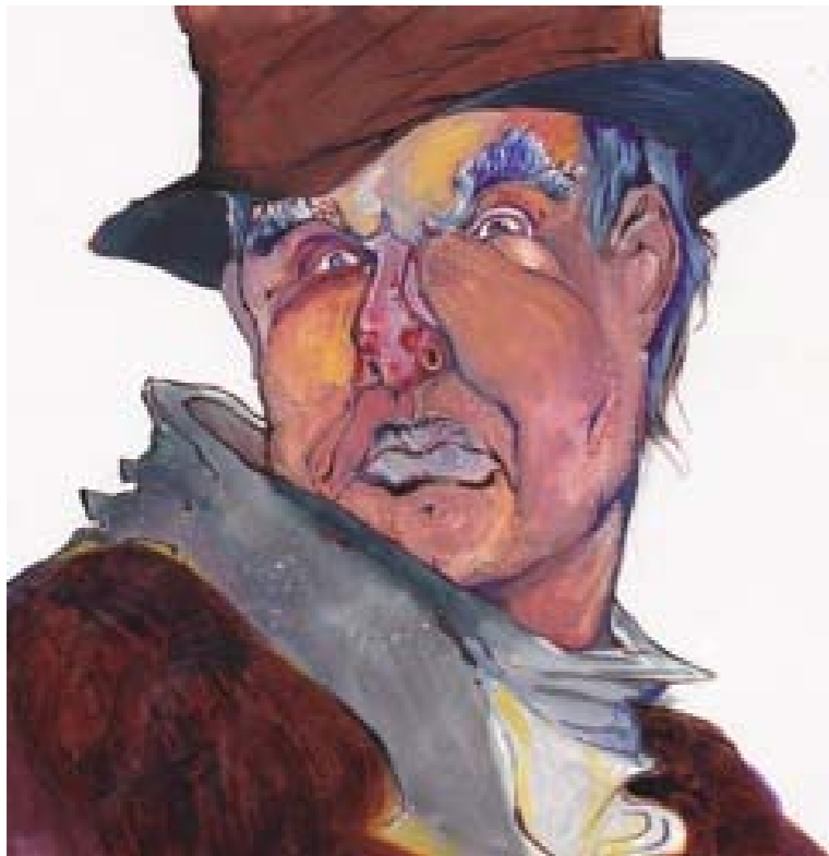
Illustration of Bill Skyes