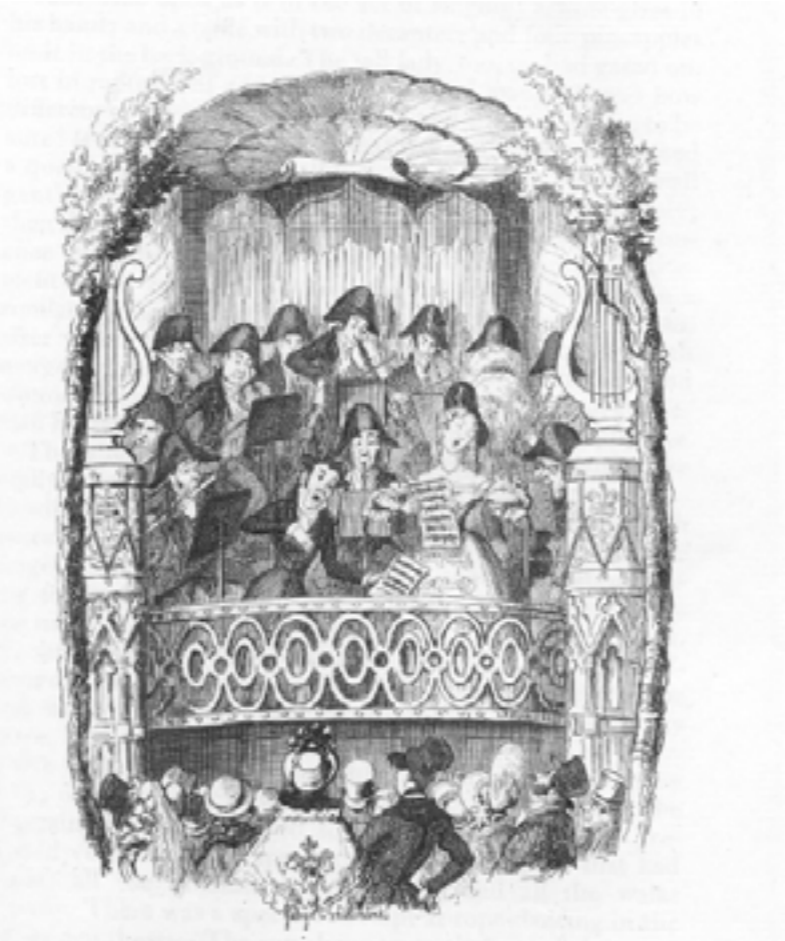
Sketches by Boz by George Cruickshank

vsweethearts and married people—babies in arms, and children in chaises—pipes and shrimps—cigars and periwinkles—tea and tobacco. Gentlemen, in alarming waistcoats, and steel watch-guards, promenading about, three abreast, with surprising dignity (or as the gentleman in the next box facetiously observes, “cutting it uncommon fat!”)—ladies, with great, long, white pocket-handkerchiefs like small tablecloths, in their hands, chasing one another on the grass in the most playful and interesting manner, with the view of attracting the attention of the aforesaid gentlemen—husbands in perspective ordering bottles of ginger-beer for the objects of their affections, with a lavish disregard of expense; and the said objects washing down huge quantities of “shrimps” and “winkles,” with an equal disregard of their own bodily health and subsequent comfort—boys, with great silk hats just balanced on the top of their heads, smoking cigars, and trying to look as if they liked ‘em, gentlemen in pink shirts and blue waistcoats, occasionally upsetting either themselves, or somebody else, with their own canes.’