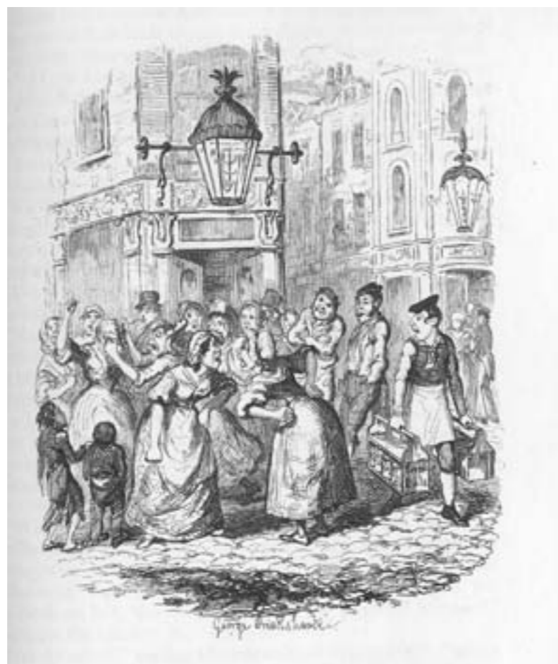
Sketches by Boz by George Cruickshank