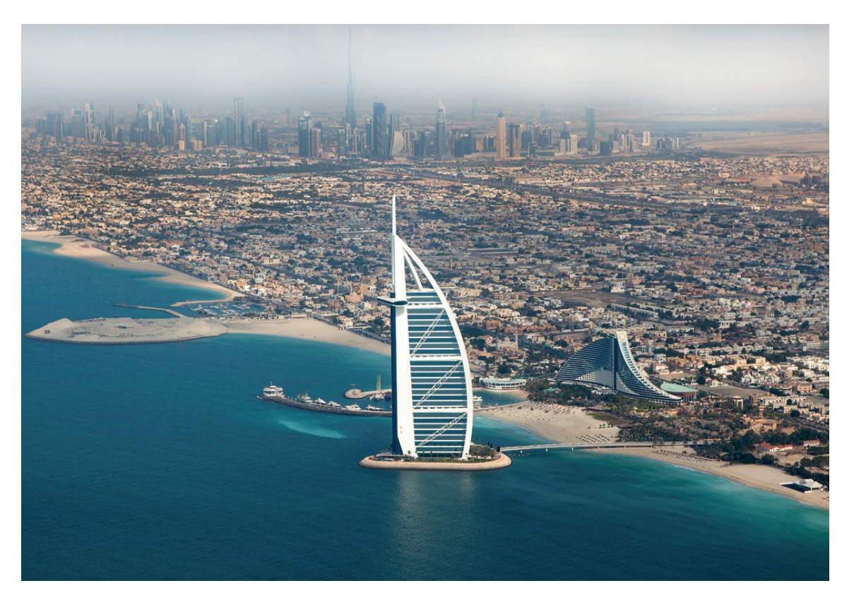
Jumeirah Beach, Dubai