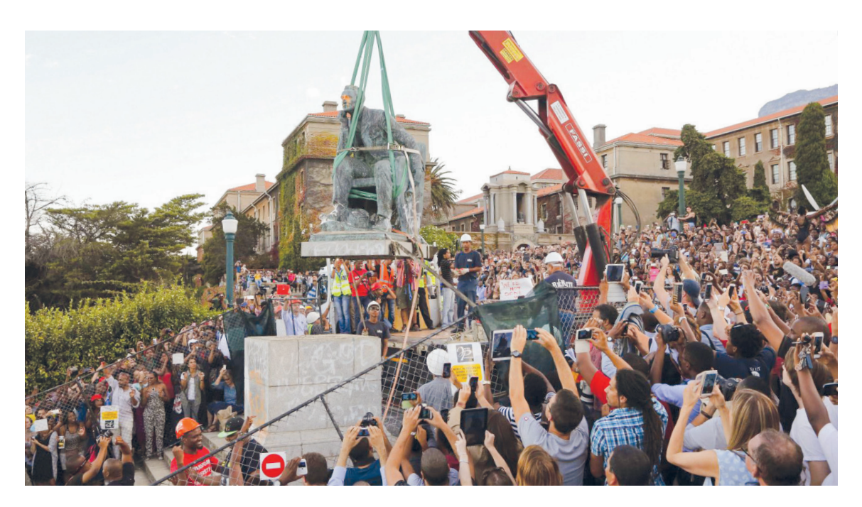
Rhodes must fall

Alongside this utopic modelling of potential futures are the equally resonant issues of grappling with a city's contested past. It is worth remembering that Jeremy Deller's soldier performers disruption of the temporal limits of public space in Bristol last year also occurred in a centre promenade in Bristol overlooked by a statue of slave-owner Edward Colston – a site of consistent and increasingly urgent debate in a city built on the slave trade. Historian David Olusoga explores the implications of public monuments as sites of contested histories through the protest movement for the removal of the Cecil Rhodes statue at the University of Cape Town and the subsequent violent rallies which erupted around the confederate statue in Charlottesville this August.