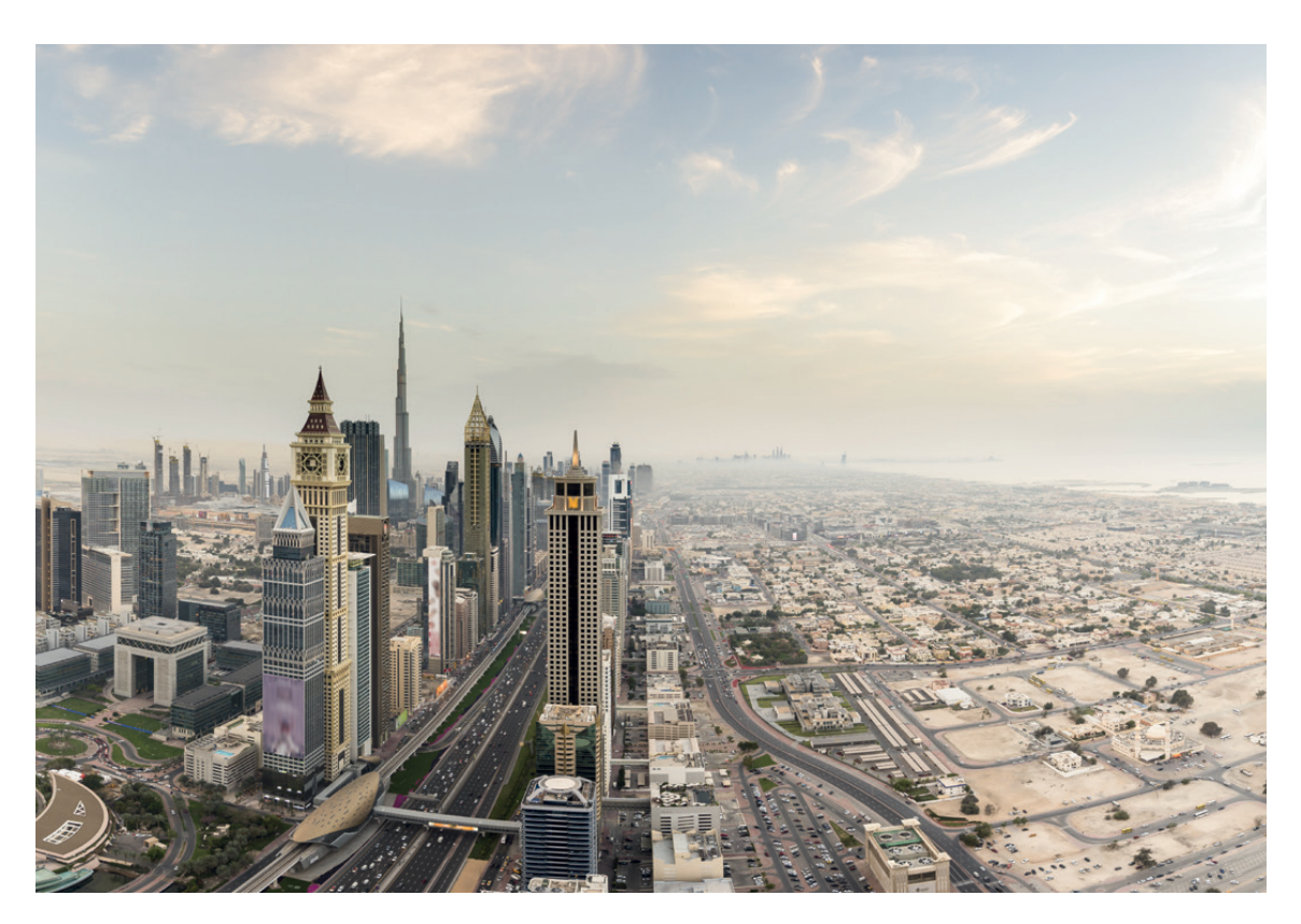
Downtown Dubai