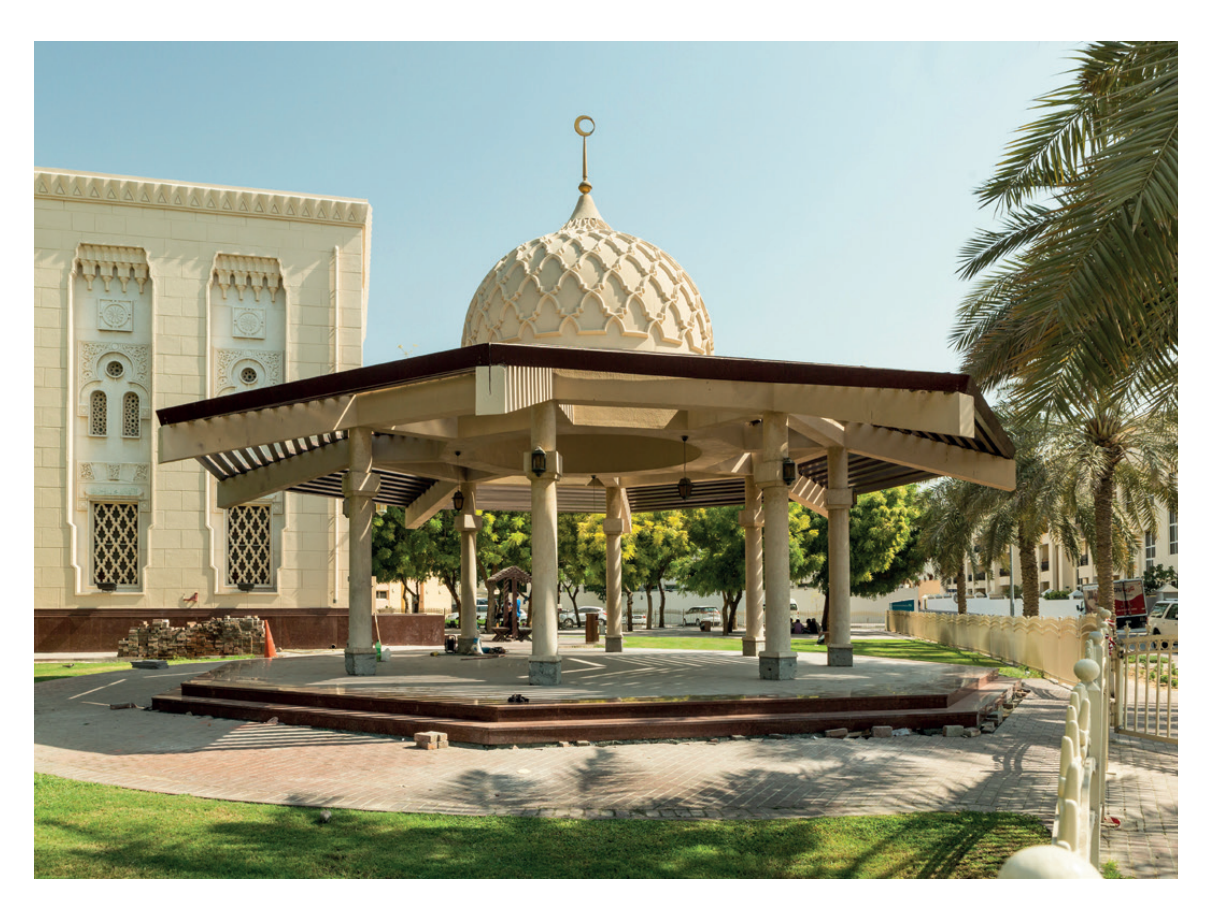
Jumeirah Mosque

would be likely to meet. Today, communications technologies have radically altered the sense of place; the public realm can be found in cyber-space as much as physically on the ground.<sup>9</sup>