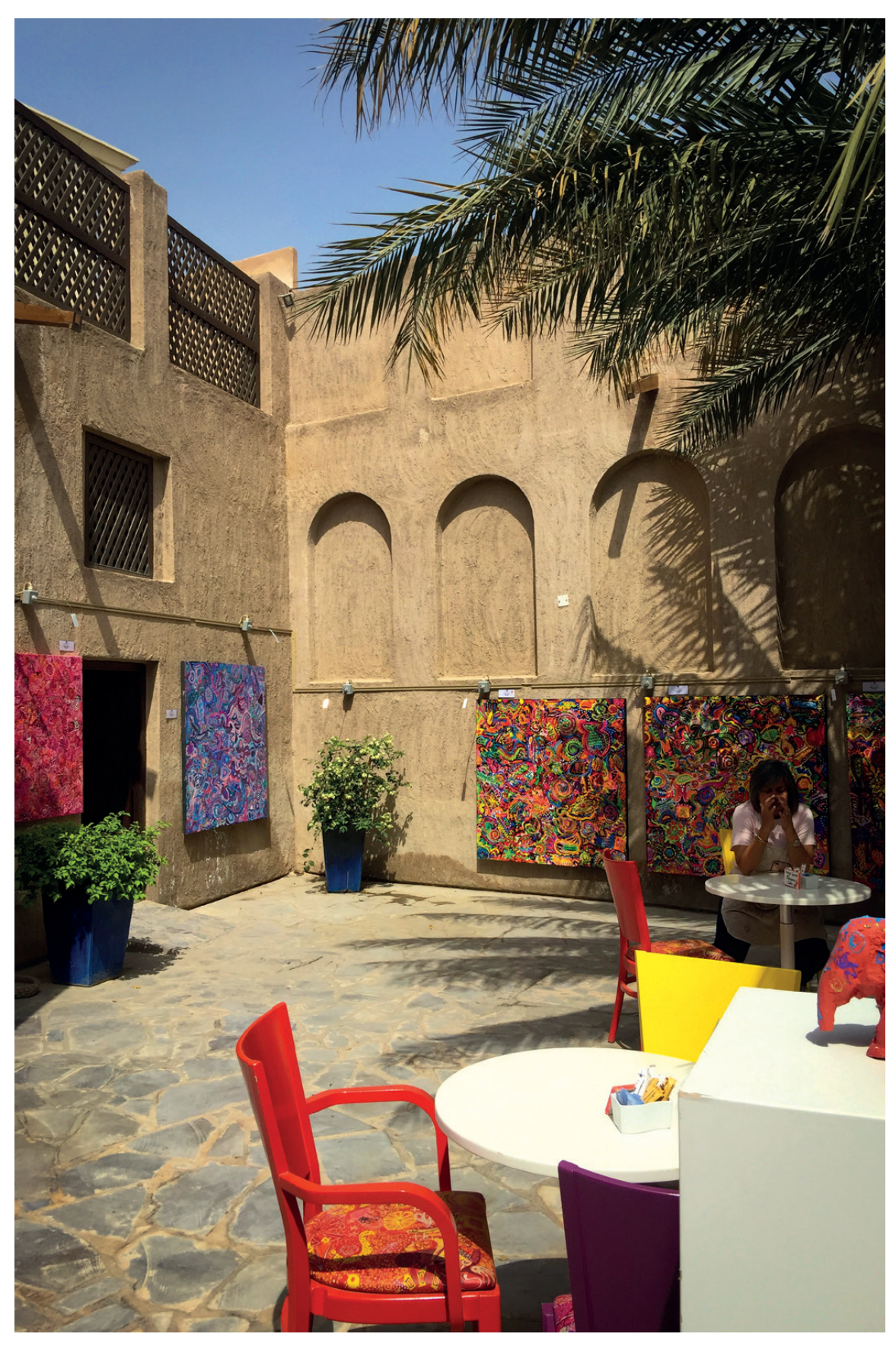
Al Bastakiya © Diba Salam Mawaheb