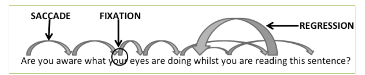
Figure 2: Key eye-tracking measures (Brunfaut & McCray, 2015, p. 10)

When working within a reading testing context, as opposed to reading per se , there are different aspects to a task that a test-taker is likely to process during test completion, for example, the task instructions, the reading input texts, and the items or questions asked to assess the test-taker's comprehension of the textual input. Differences in test-taker ability, for example, may be associated with differences in time spent on different parts of the visual stimulus or switches between the parts. These different parts can be defined by the researcher on the basis of the study's focus, and are called areas of interest (AOIs).