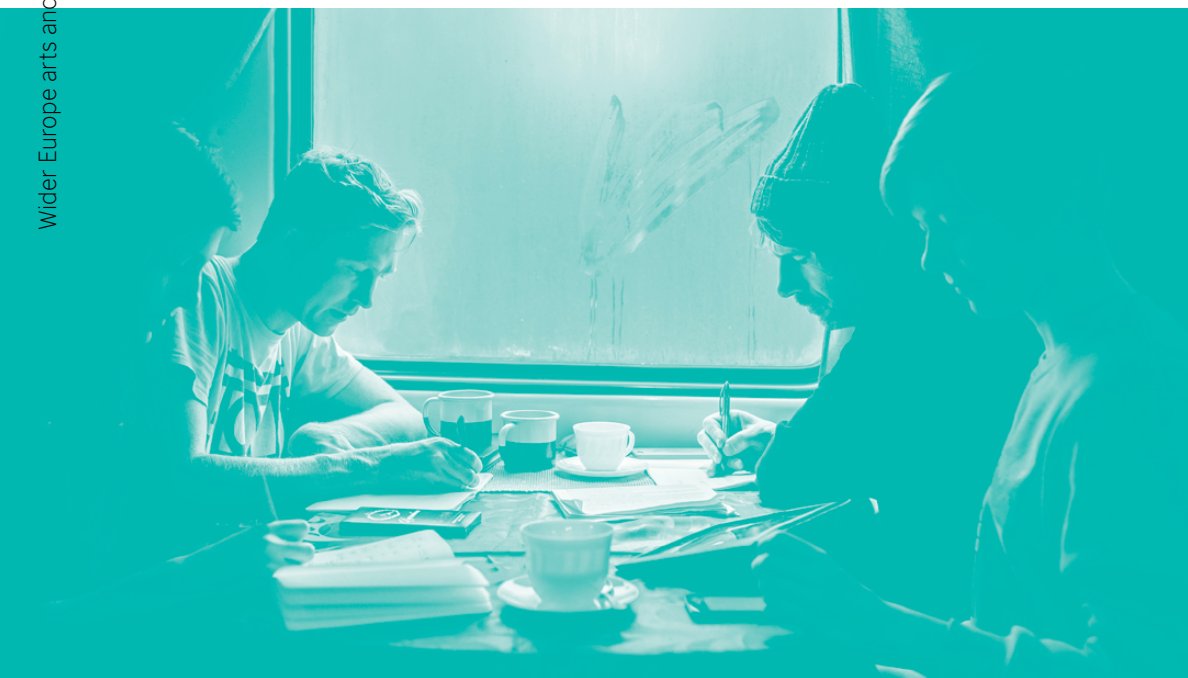
Left: TransLit: UK writers on the Trans-Siberian Railway.

The region's countries have a rich cultural heritage and established traditions in craft and design, film, literature and the visual and performing arts. National institutions, particularly in the former Soviet Union, remain well-funded. However, with state investment focused on the maintenance of large performing ensembles, heritage buildings and complex administrative structures, there is little money spare for commissioning new work or fostering young talent. Decades of dependence on guaranteed public subsidy have resulted in a focus on repertoire and collections rather than audiences and participation, while the development of programming through diversification of income streams is a new concept. Culturally diverse practice, as we understand it, is underdeveloped and a lack of inclusivity in legislation and civil society means that disabled people are usually excluded from wider cultural participation.