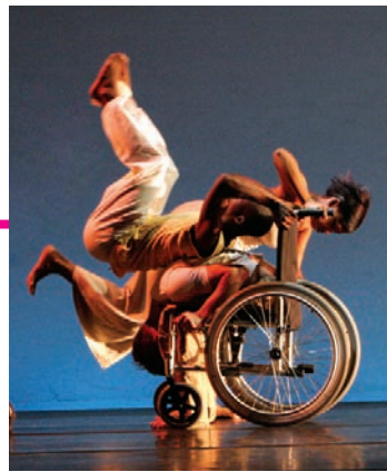
Second Time Broken © Remix Dance Company

Unlimited is part of the Cultural Olympiad and works will feature in the London 2012 Festival.