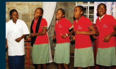
Choir performing as part of International Voices project in Nairobi, Kenya at a British Embassy event.

The schools element of Youth Music Voices is a partner programme of the London 2012 Education Programme.