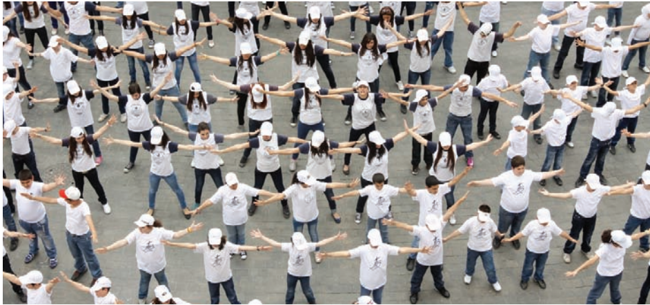
Big Dance event in Beirut