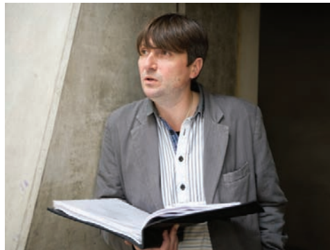
Simon Armitage

Poetry Parnassus will feature in the London 2012 Festival.